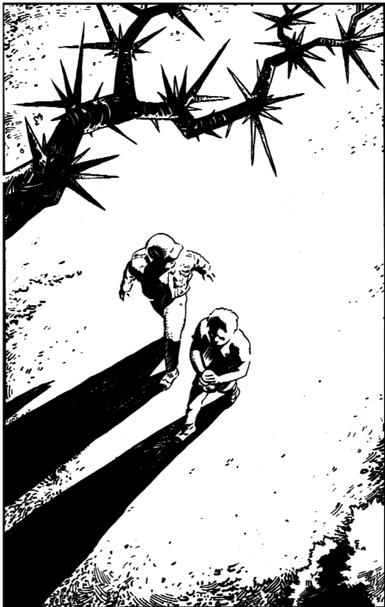
Donut's second favorite activity